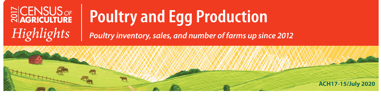
In 2017, U.S. sales of poultry and eggs totaled $49.2 billion, 12.7% of total U.S. agriculture sales. Sales of poultry and eggs increased 15% from 2012 to 2017. The top three states, Georgia, North Carolina and Arkansas, accounted for about a third of U.S. sales. Eighteen states sold over $1 billion in poultry and eggs. Of the 164,099 farms that produced and sold poultry and eggs, 27% were farms specializing in poultry and egg production, which accounted for 98% of poultry and eggs sold.